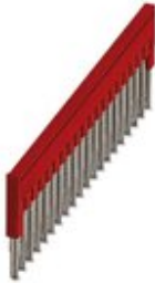
Plug-in bridge, pitch: 4.2 mm, number of positions: 20, color: red

Please be informed that the data shown in this PDF Document is generated from our Online Catalog. Please find the complete data in the user's documentation. Our General Terms of Use for Downloads are valid ( http://phoenixcontact.com/download )